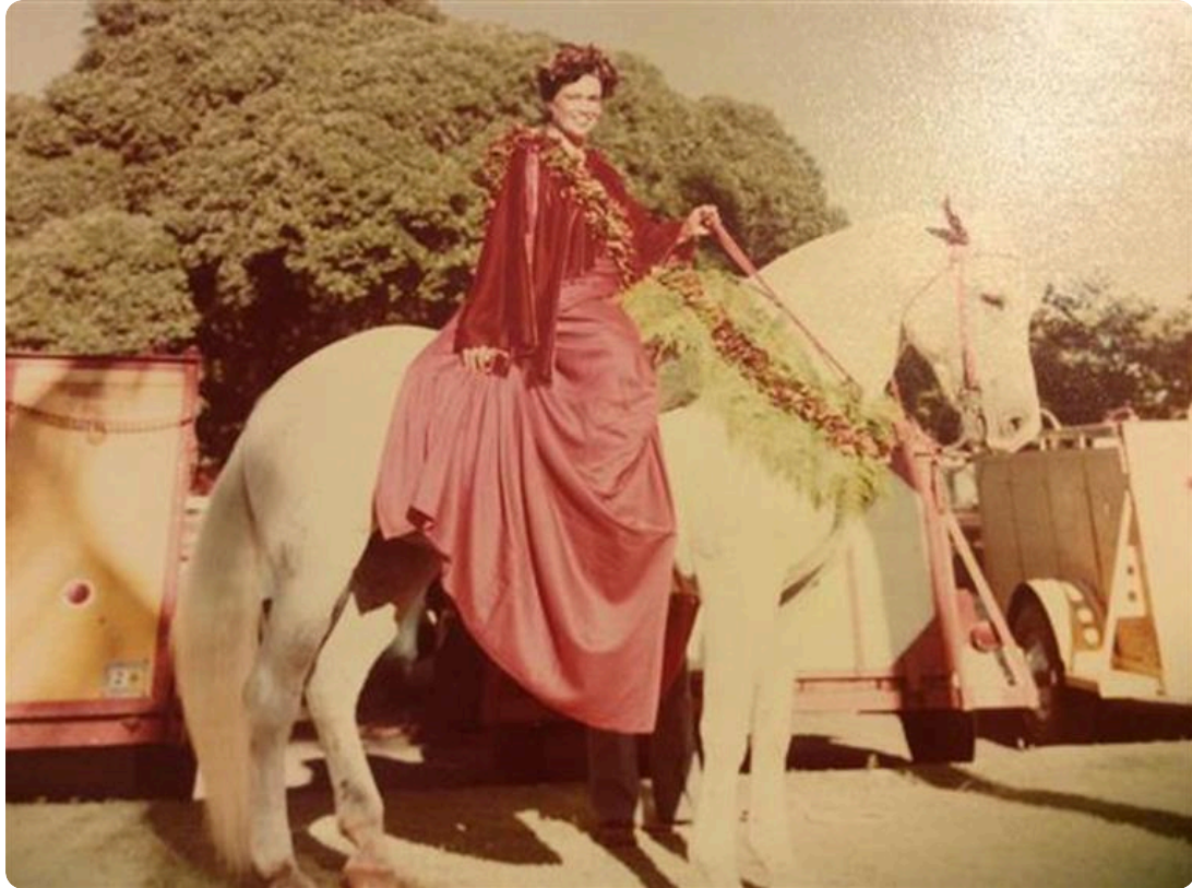
Our lovely queen, I love you grandma